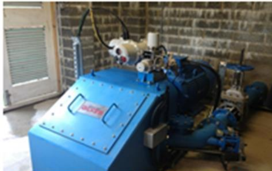
100kW UK manufactured turbine - Ardnamurchan, Scotland