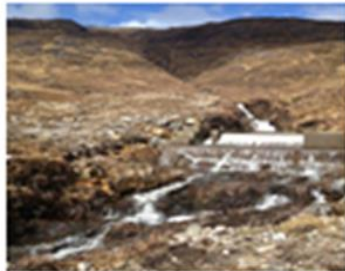
Intake - 100kW run of river scheme Ardgout, Scottish Highlands