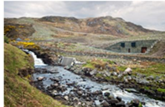
Power House - Meldie 4 MW storage scheme, Sutherland, Scottish Highlands