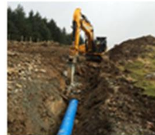
Laying pipeline - Merk hydro 1 MW scheme, Argyll & Bute