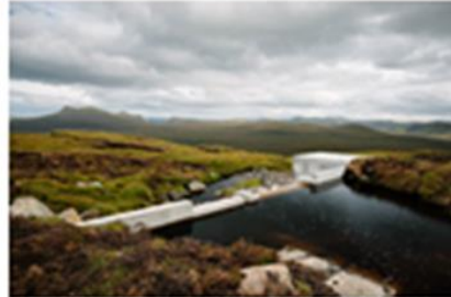
Intake - 800kW hydro scheme, Achnasheen, Scottish Highlands