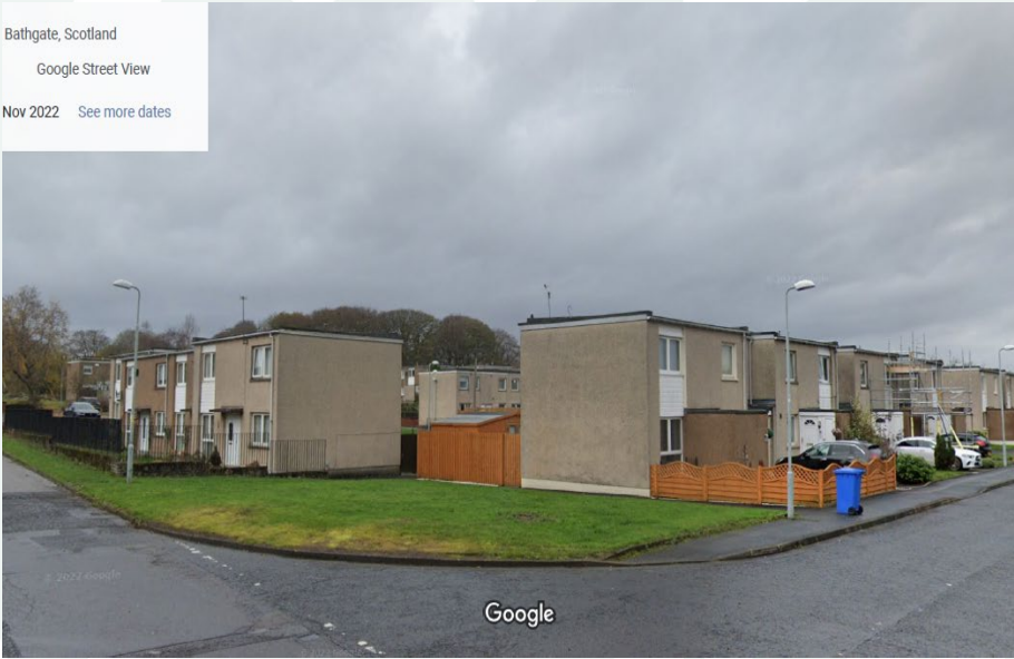
Council - 34 Houses & 1 common block