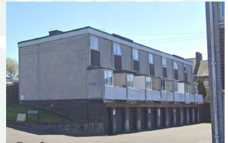
Council - 9 Houses & 1 common block