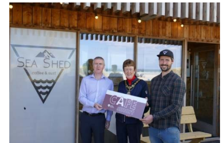
Sea Shed, Benone

23 properties signed up to Café Smart promoting sustainability and reducing single use plastics.