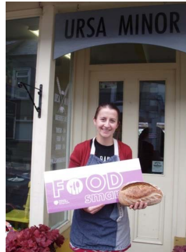
Ursa Minor, Ballycastle