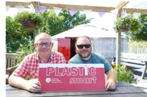
Incredible Edibles, Cloughmills