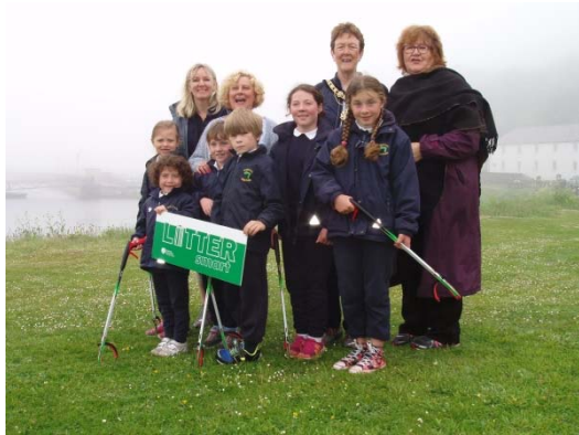
St Mary's Primary School, Rathlin Island

35 groups from April to October 2018 collected 16 tonnes of litter across the borough.