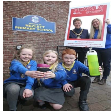
Hezlett Primary School, Castlerock