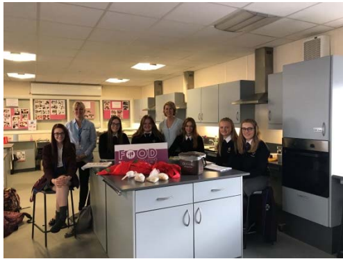
A-Level Food Science and Nutrition Class, Dalriada School, Ballymoney