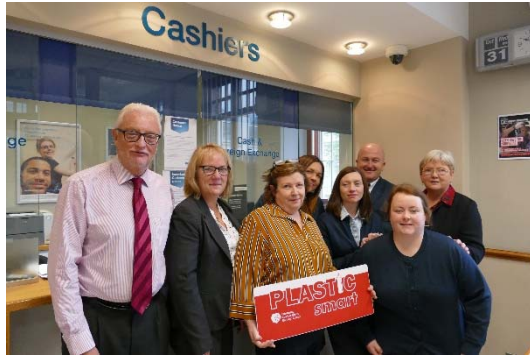
Bank of Ireland, Coleraine