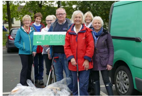
Soroptomists at Riverside Park, Ballymoney

35 groups from April to October 2018 collected 16 tonnes of litter across the borough.