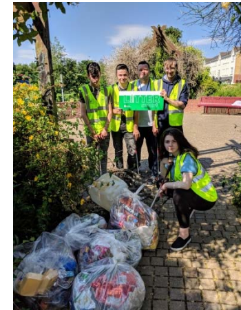
Coleraine Youth Council at Anderson Park, Coleraine