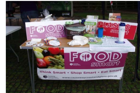
Lark in the Park information Stand, Cushendall