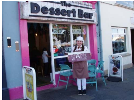
Dessert Bar, Ballycastle